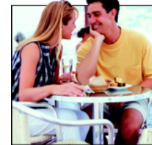
Time out. Set aside a regular time every week just for being together.

Today, we're just beginning to understand the sex-pleasure connection in neurochemistry and the role it plays in chemical dependency.