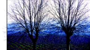
Seasons of the heart. Recovery is a process, not a thing. And rebuilding intimate relationships doesn't happen overnight.

Let's start with impatience—because for a good many recovering couples, impatience is a flame looking for something to burn.